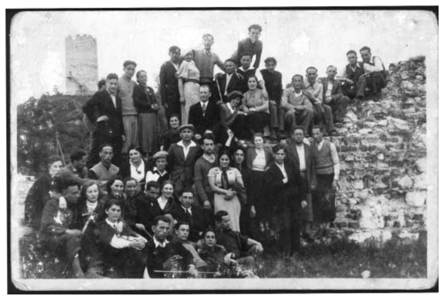
Warsaw Library League members on a fieldtrip to the ruins of the castle of Kazimierz the Great. The watchtower is in the distance (1930s).