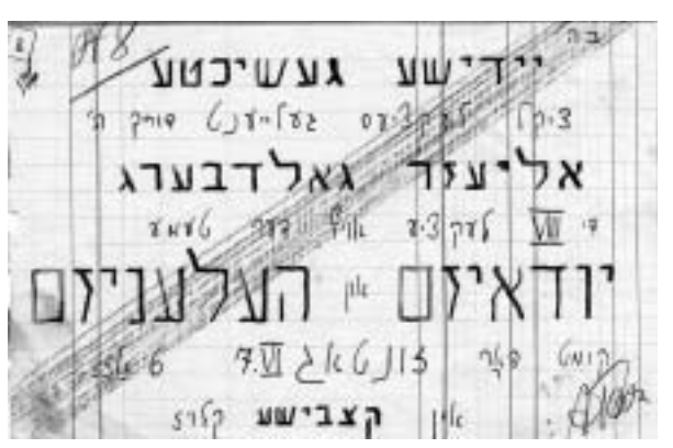
אַפֿיש פֿון אַן אונטערנעמונג אין ווילנער געטאָ

ווי אויף חורבן ירושלים", האָבן די ערשטע דײַטשן, ווי אויף חורבן ירושלים", האָבן דעם עלנטן מכבד געווען צווישן זיך געמורמלט. זיי האָבן דעם עלנטן מיט סיגאַרעטן, מיט וואַסער, מיט קאַווע, רום. זיי האָבן אים