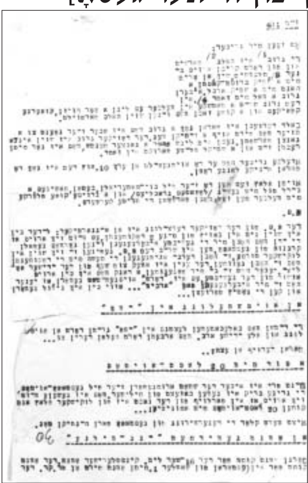
. פֿראַגמענט פֿונעם טאָגבוך

פֿאָטאָגראַפֿירט צוזאַמען מיטן הונט אויף דעם פֿאָן פֿון די חורבֿות און אַוועק אין זייער ווײַטערן וועג.