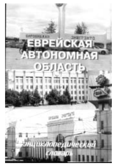
Evreiskaia avtonomnaia oblast': entsiklopedicheskii slovar' (Jewish Autonomous Region: an Encyclopedia)

(Various Fates - Common Fate: History of Cheliabinsk Jews), Cheliabinsk, 1999: A history of Cheliabinsk, the city of almost four million people situated at the foot of the Ural Mountains, from the second half of the 18th century until the present. Since the Perestroika, its Jews have been able to live real Jewish lives and to establish Jewish cultural and religious institutions. The book also